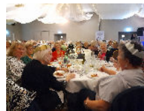
At the Mercury Hotel

Afterwards we warmed up with a cup of tea and mince pie. Collection raised £133 half will go to the church, the rest of the money to the local food bank, that we support every month.