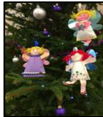
Christmas tree fairies & angels