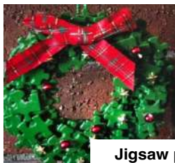
Jigsaw puzzle Christmas Wreaths