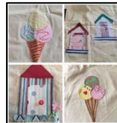
Appliqué tote bag Choice of design