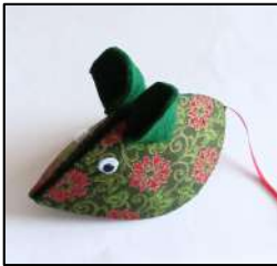
Christmas mouse to hold a little gift

Choose two crafts from those displayed, one for the morning and one for the afternoon. Details of any equipment required will be sent to those who have booked nearer the date.