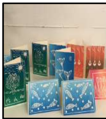
Lino cut cards