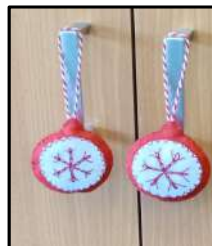
Felt tree decorations