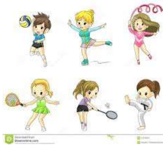
Illustration from Dreamstime.com

Tuesday 5th November 7.00 pm £3 Crazy Sports Evening